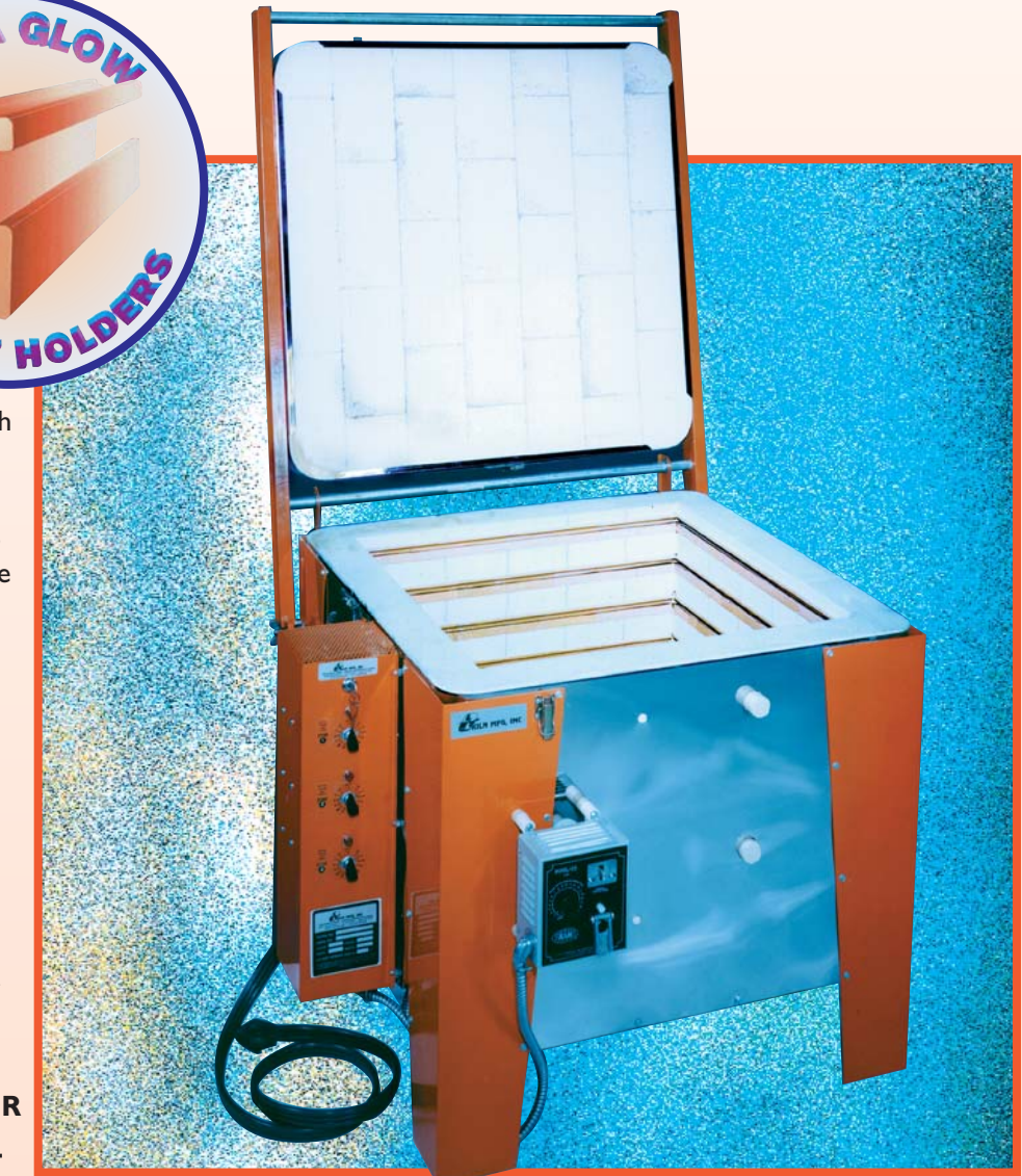
SAFETY DESIGNED FOR SCHOOLS AND INSTITUTIONS