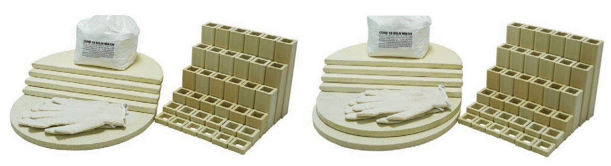
Furniture kit for a J18-3.

For all Dimensions and Weights: See hotkilns.com/jupiter-dimensions.pdf