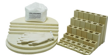
Furniture kit for a e18T kiln.