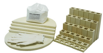
Furniture kit for a e18S kiln.