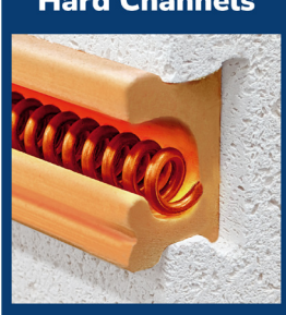
Protect Your Brick