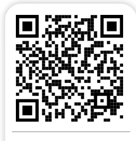
Scan OR Visit: hotkilns.com /e23M-3-GD