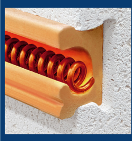
Protect Your Brick