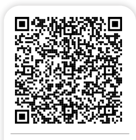
Scan OR Visit: hotkilns.com /e18T-3-GD