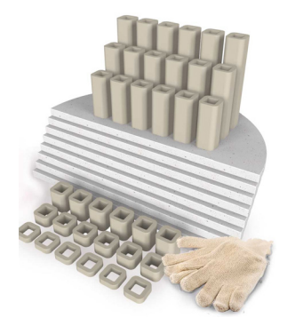
FURNITURE KIT FOR e23T-3

Shipping Dimensions: See website for shipping dimensions with various combinations of options.