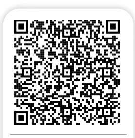
Scan OR Visit: hotkilns.com /e18S-3-GD