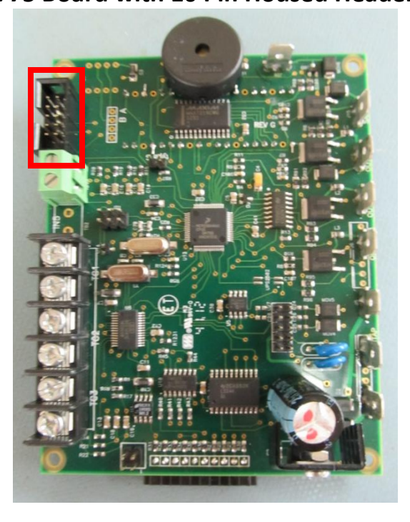
775 Board with 10 Pin Housed Header

Use K.I.S.S. 3 Extension Kit for new installations.