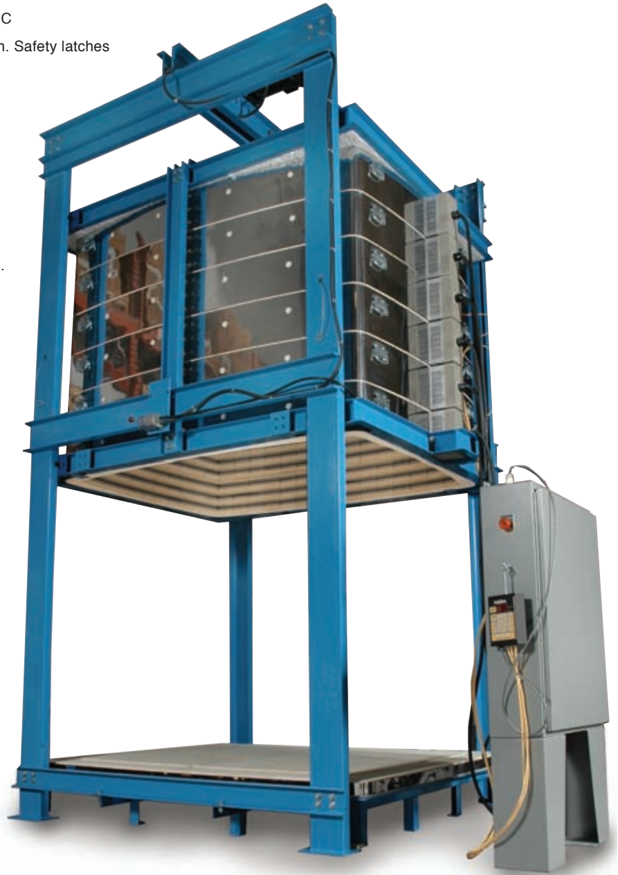
This kiln is remarkably easy to assemble and install for such a large kiln. ( hotkilns.com/assembly-tb644754 )

Warranty: Limited 3 year warranty. ( hotkilns.com/warranty ).