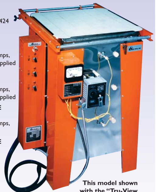
This model shown with the "Tru-View Pyrometer System"