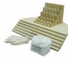
Furniture kit for a J2918.

For all Dimensions and Weights: See hotkilns.com/jupiter-dimensions.pdf