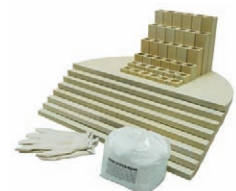
Furniture kit for a J2927.