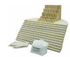
Furniture kit for a J2945.