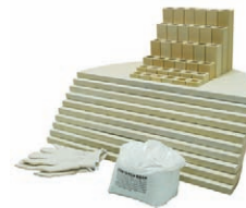
Furniture kit for a J2936.