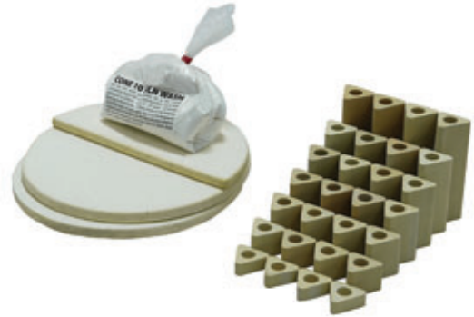
Pictured is a furniture kit for a Doll kiln.

General Dimension Drawings: Not available at this time.