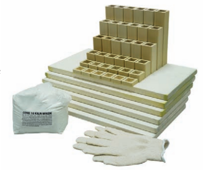
Furniture kit for an X2327-D

For all dimensions and weights: See hotkilns.com/davinci-dimensions.pdf.