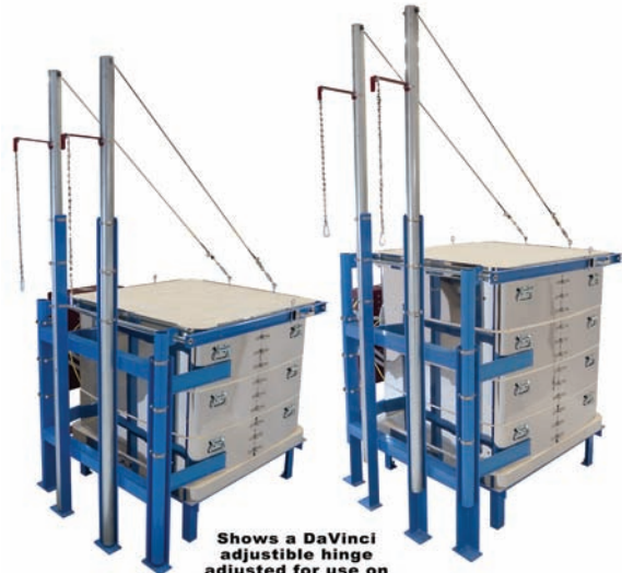
Shows a DaVinci adjustable hinge adjusted for use on an X3227 or an X3236