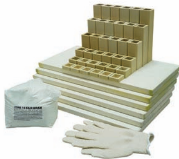
Furniture kit for an X2327-D

Shelves are high alumina cone 11 shelves. Shelves are 10" x 20" x 3/4". See below for quantity. Each post kit includes six each, 1/2", 1", 2" 4", 6" and 8" high 1-1/2" square cordierite posts. All furniture kits include heat-resistant gloves and 1 lb of cone 10 kiln wash.