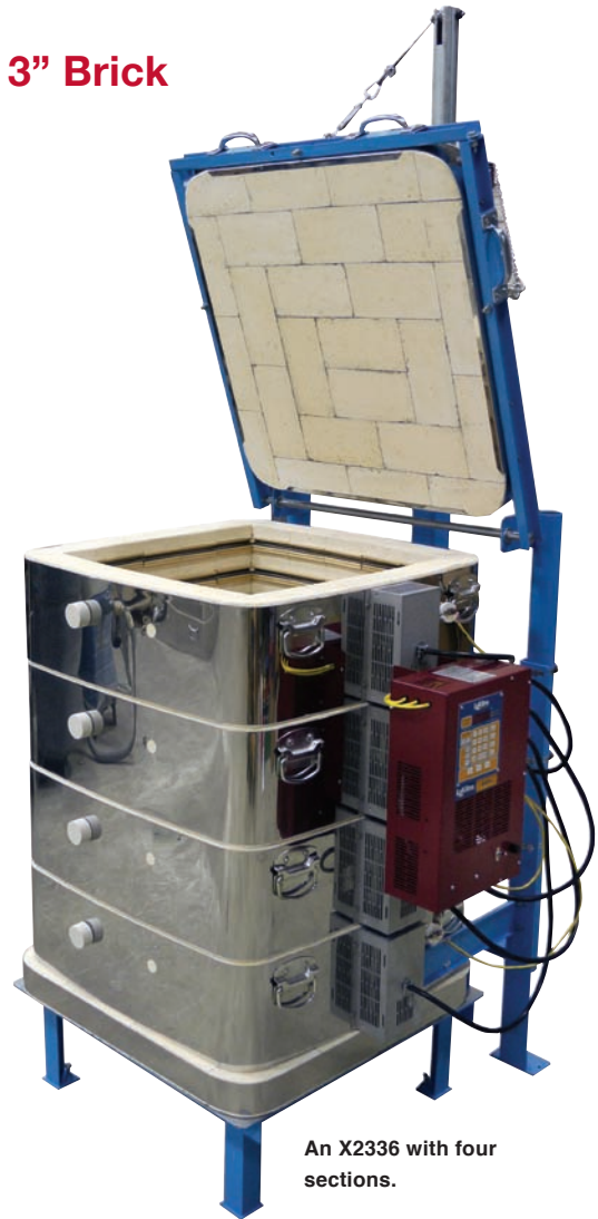
An X2336 with four sections.

UL Listing: c-MET-us listed to UL499 standards.