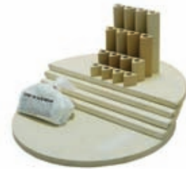
Pictured is a furniture kit for a LB18-3 kiln.

General Dimension Drawings: Not available at this time.